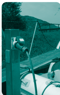
Shore 250V / 50 Hz 1-phase, 2-pole, 3-wire