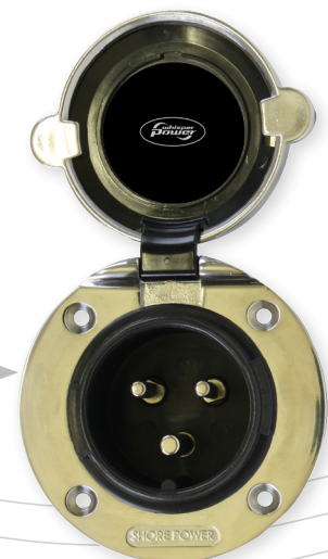
Power inlet stainless or polyamide 16 & 32A 250V / 50 Hz 1-phase, 2-pole, 3-wire